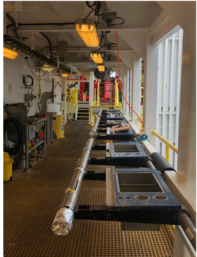
Figure 3. A total of 11 modules were combined in three section on the catwalk in anticipation for deployment within DSDP Hole 504B on IODP Expedition 385T in August 2019 (Tominaga et al., 2019). Final assembly and connection to other sensing instruments would occur on the rig floor, which is up the four steps at the end of the catwalk. Aseptic aluminum foil covers the fluid intake to minimize microbial contamination prior to deployment.

The first use of the MTFS was planned during the reentry of DSDP Hole 504B on IODP Expedition 385T “Panama Basin Crustal Architecture and Deep Biosphere: Revisiting Hole 504B and 896A” (Tominaga et al., 2019). The goal was to clear scientific equipment in both holes, sample borehole fluids, and log the boreholes. Neither hole was cleared; thus, the MTFS was not deployed (Fig. 3). DSDP Hole 504B is \sim 190 \text{ }^\circ\text{C} at the base of the open borehole (Guerin et al.,