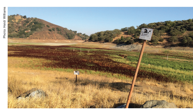
No swimming, no diving ... no problem in parched lakebeds like Chesbro Reservoir in Morgan Hill, California.

Recharging California's groundwater and managing its use in a more conservative, concerted manner is an important step toward water solvency. "We use groundwater as a buffer when there is not enough surface water to serve our