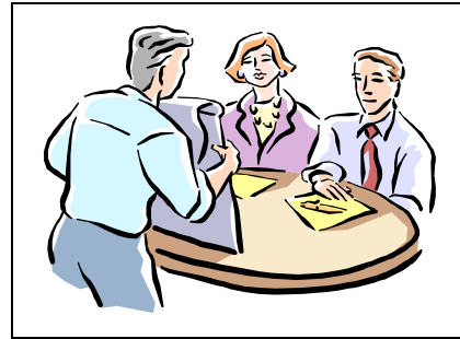
Congratulations..... Job Well Done!!!!

Forty-nine papers were presented in twelve sessions and, this year, the presenters came from fifteen colleges and universities in the Western United States and from schools as far away as Virginia, Tennessee, and Kentucky!! Topics ranged from "The Neocolonialism of