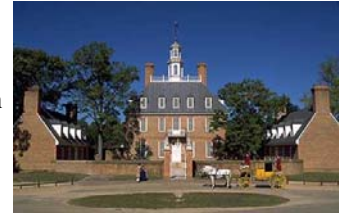
The Governors Palace Colonial Williamsburg

to start the summer. "Our country is truly a fascinating place and has an even richer history."